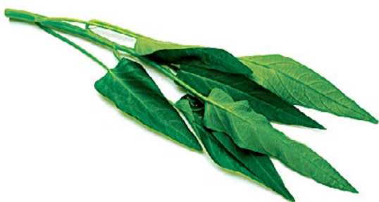
Ong choi [Water spinach]