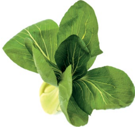
Shanghai Bok choy