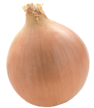
riki / aniana