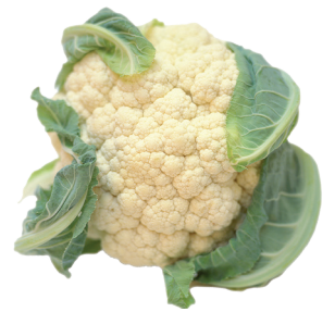
puānīko / pūputi / kareparāoa