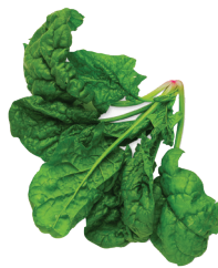
rengamutu / kōkihi