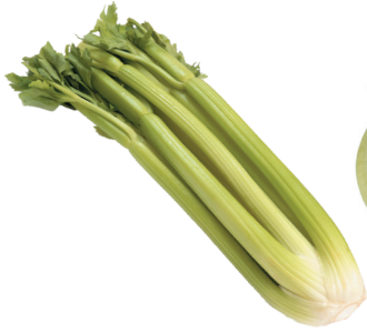
tutaekōau / hereri / herewī