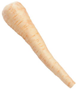
tāmore mā / uHITEA