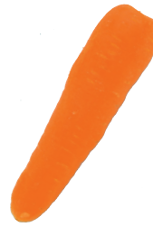
uhikaramea / kāreti