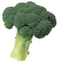
pūpihi / poroki